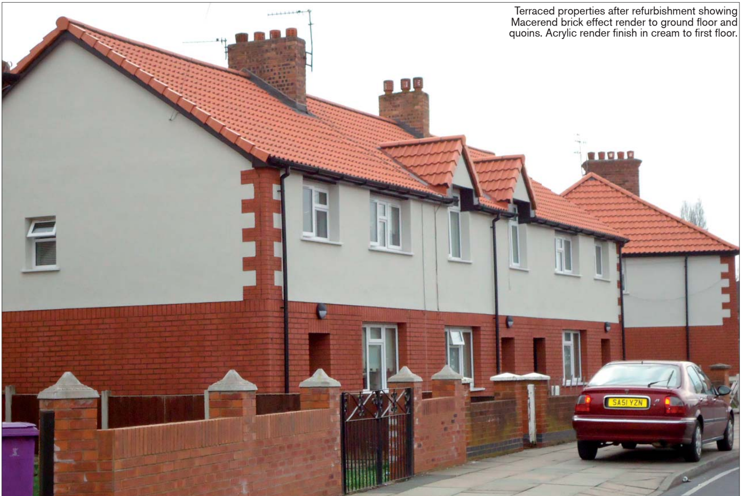
Terraced properties after refurbishment showing Macerend brick effect render to ground floor and quoins. Acrylic render finish in cream to first floor.